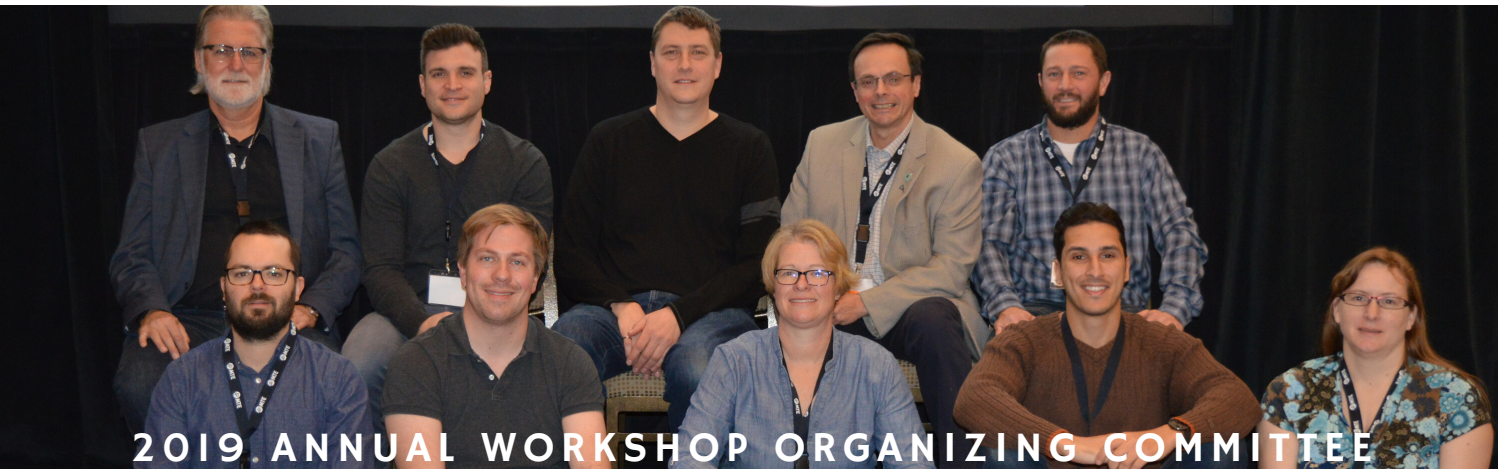
2019 ANNUAL WORKSHOP ORGANIZING COMMITTEE